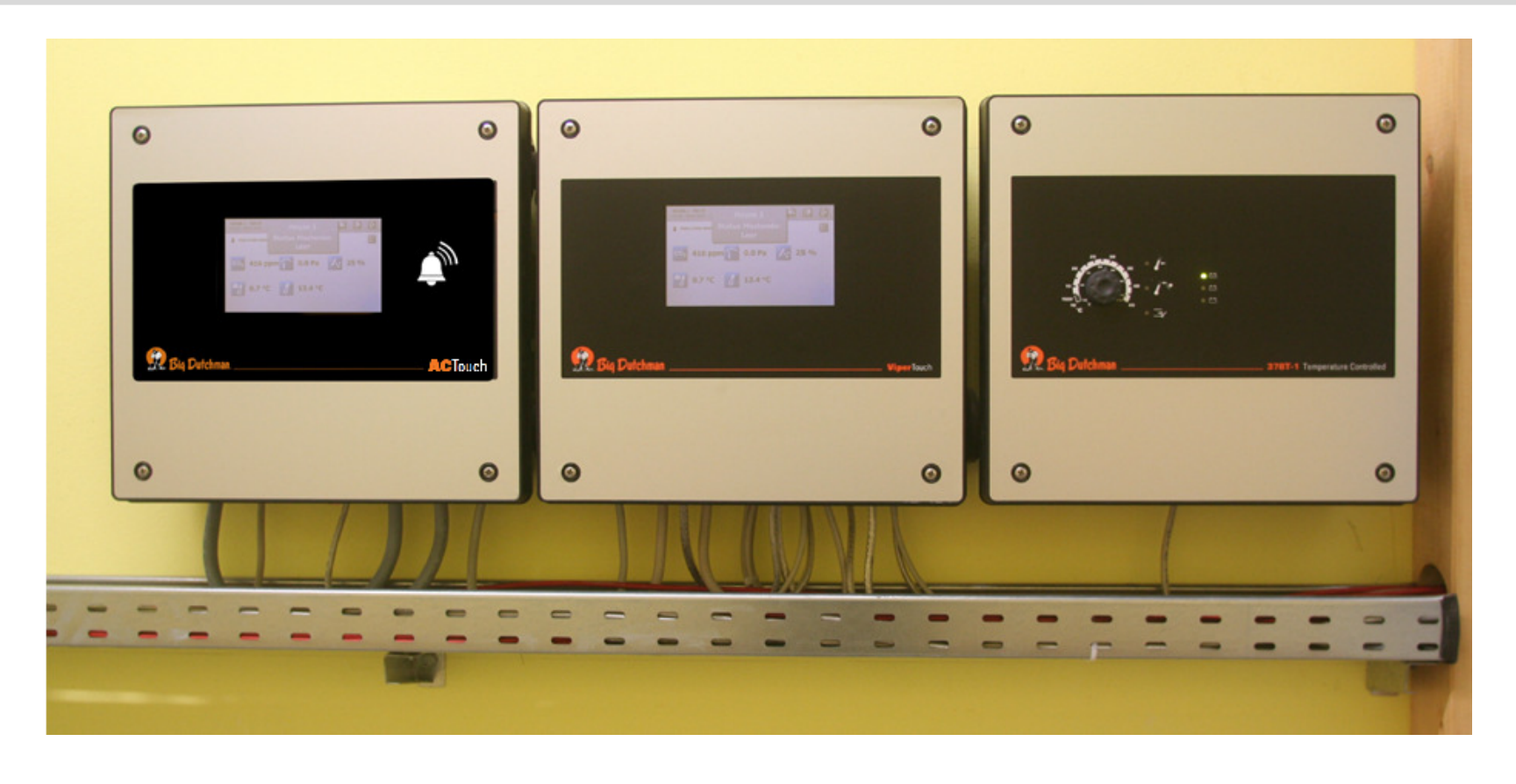
The AC Touch fits perfectly into our Viper Touch and emergency opening family